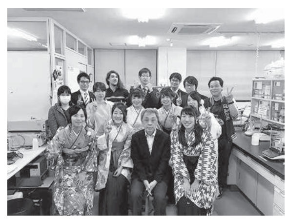
Bioprocesses team in graduation day (2017)

I think that every scientific researcher, should have an international experience. This is one of the reasons why I wanted to study in Japan in the first place. Also, Japanese culture is so different from Portuguese culture that I thought this would be a very enriching experience. In my opinion, the world is like a library, every single person is a different exotic book. One can always learn something from another person. The further we go, the more we learn.